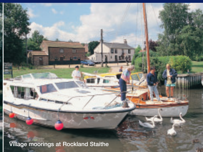
Village moorings at Rockland Staithe