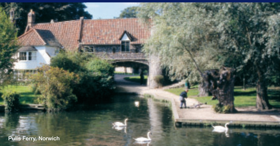
Pulls Ferry, Norwich

Pass picturesque town houses before gliding into varied countryside. Marsh, undulating farmland, and woodland pass you by before a brief glimpse of village bustle in Brundall. The Broads of Surlingham and Rockland beckon, then you're into real Broads boating territory – reed-fringed river and open marshland.