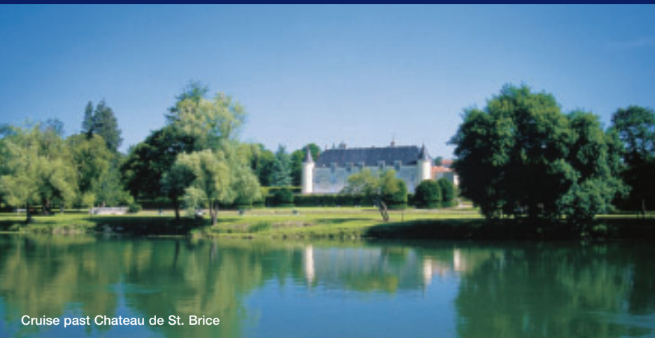
Cruise past Chateau de St. Brice

A little further seaward is the ancient Roman town of Saintes with a ruined amphitheatre, an interesting museum and flowers everywhere. It's a worthy distraction.