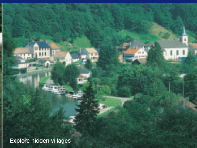
Explore hidden villages